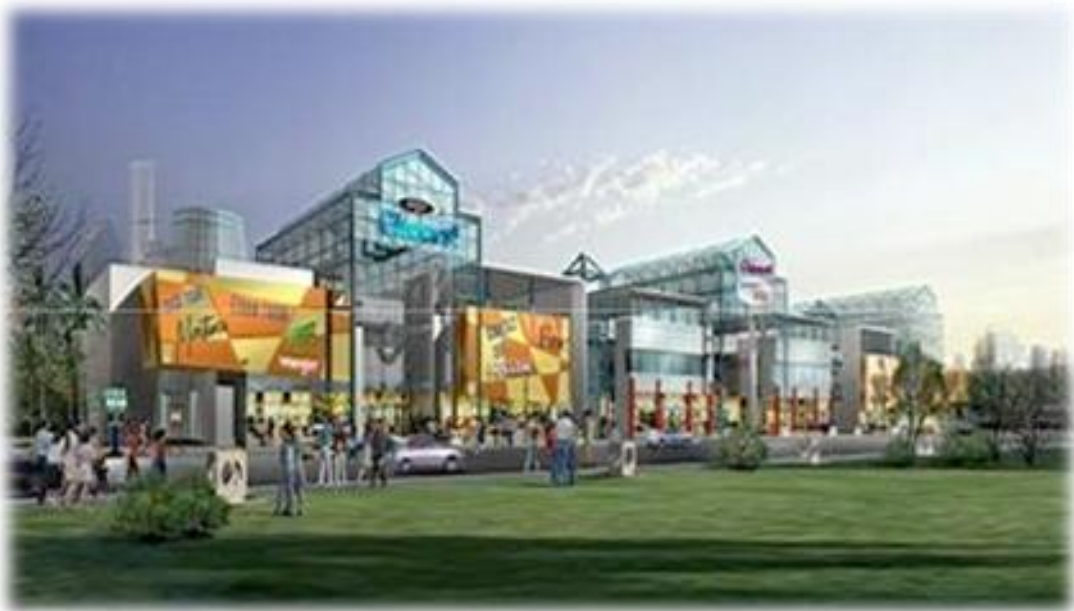
View of the Shenyang European Union Economic Development Zone